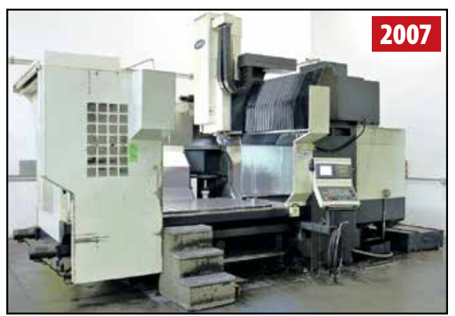
QUALITY MACHINE TOOL MIGHTY VIPER PRO 2150 AG CNC BRIDGE MILL