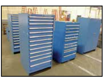
VIDMAR AND LISTA TOOL CABINETS