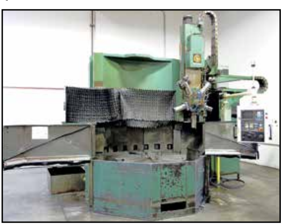
GIDDINGS & LEWIS 60" CNC VERTICAL TURRET LATHE