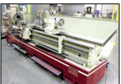
ACER DYNAMIC 24120GA HEAVY DUTY PRECISION GAP BED LATHE