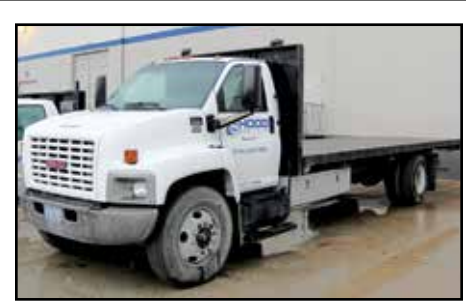
GMC G6500 DURAMAX DIESEL LONG BED STAKE TRUCK

GMC C6500 DURAMAX DIESEL LONG BED STAKE TRUCK