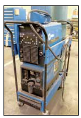
MILLER MAXSTAR DX TIG/ STICK INVERTER WELDER