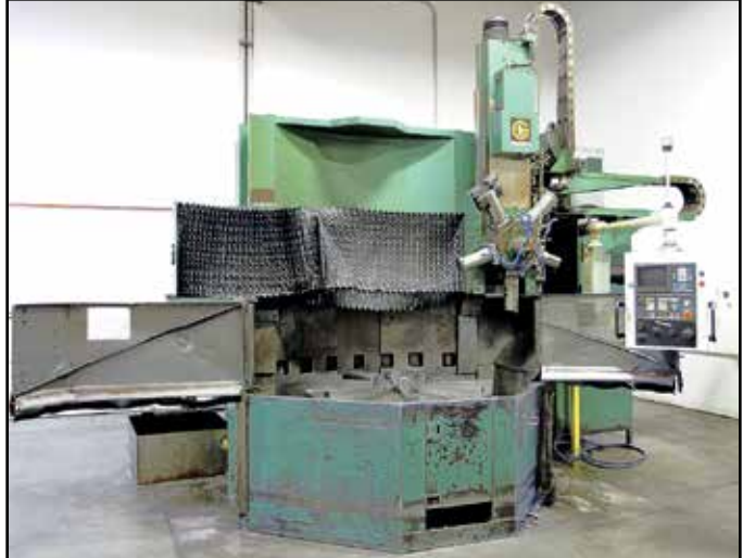
GIDDINGS & LEWIS 60" CNC VERTICAL TURRET LATHE

Sale Date: Thursday, June 28 at 10:00 AM PT