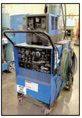
MILLER SYNCROWAVE 250 MIG WELDER