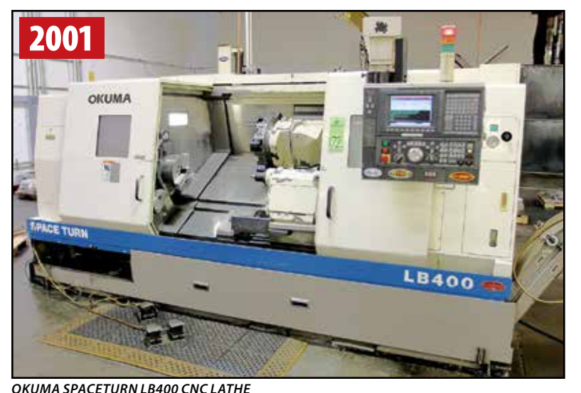
OKUMA SPACETURN LB400 CNC LATHE

FEATURING: MACHINING CENTERS, CNC LATHES, VERTICAL TURRET LATHES, MACHINE TOOLING, CYLINDRICAL GRINDERS, FABRICATING EQUIPMENT, WELDERS, TANK TURNING ROLL SETS, FORKLIFTS, BRIDGE CRANES, JIB CRANES & FACTORY SUPPORT