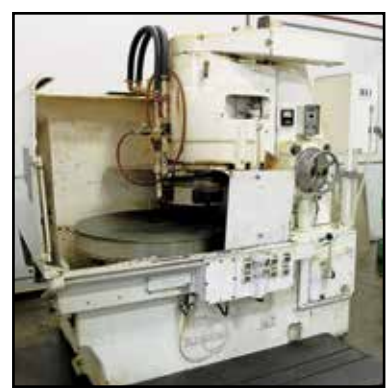
BLANCHARD NO. 18 ROTARY SURFACE GRINDER