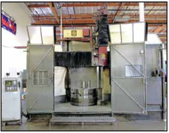
GIDDINGS & LEWIS 48" HI-COLUMN CNC BORING MILL

To discuss your requirements for an auction, please call Perfection Industrial +1-847-545-6374