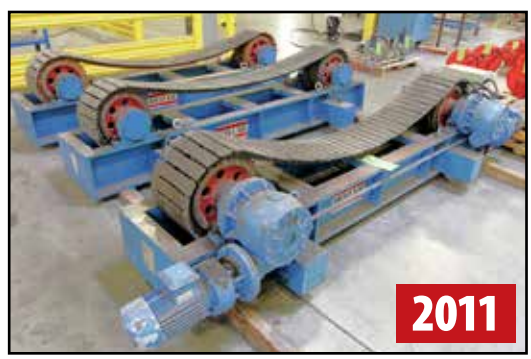
IRIZAR CWR-40 POWER CHAIN-TYPE TANK TURNING ROLLS