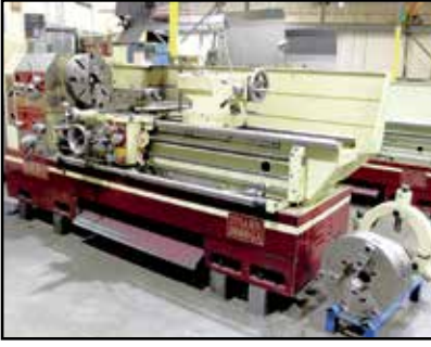
ACER DYNAMIC 2060GA GAP BED LATHE