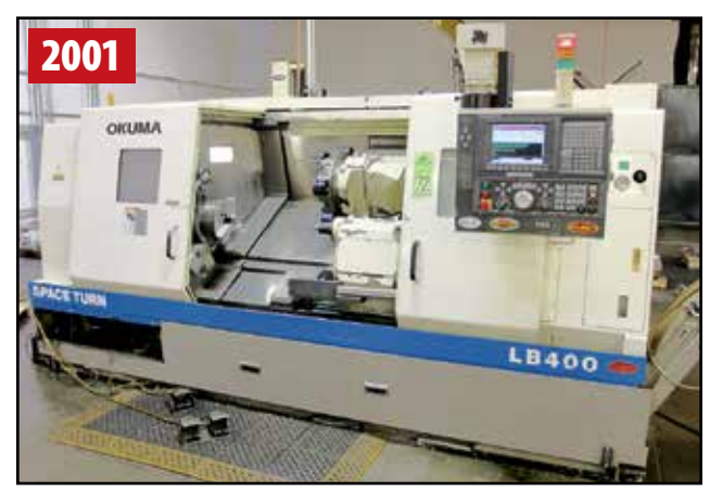
OKUMA SPACETURN LB400 CNC LATHE