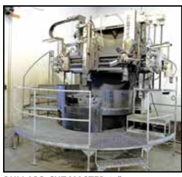
BULLARD CUT MASTER 64" VERTICAL TURRET LATHE

1998 FADAL VMC4020HT CNC VERTICAL MACHINING CENTER, s/n 9801307, Fadal 88 HS CNC Control, CAT 40 Spindle Taper, 21-ATC