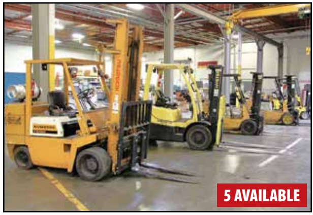
VIEW OF FORKLIFTS

9,000 LB KOMATSU PG45S LP FORK-LIFT, s/n 95077, Dual Mast, Side Shift, 48" Fork Length