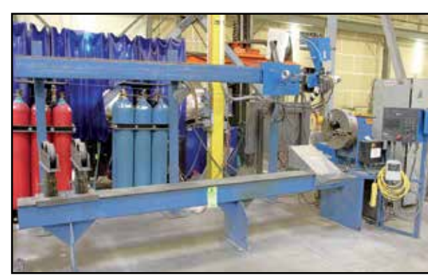
PANDJIRIS ALPHA 5-3 SUB ARC WELDING POSITIONER