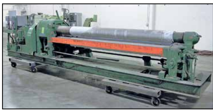
WEBB 6L PLATE BENDING ROLL

ACCURSHEAR B837510 10' X 3/8" POWER SQUARING SHEAR, s/n 201 HEM 1200A HORIZONTAL BANDSAW, s/n 109480, 5 HP, 8' Outfeed Conveyor