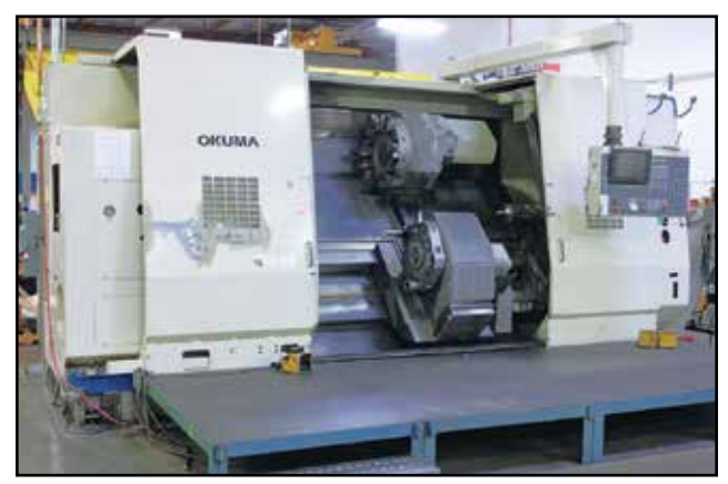
OKUMA LU-45M 4-AXIS CNC LATHE