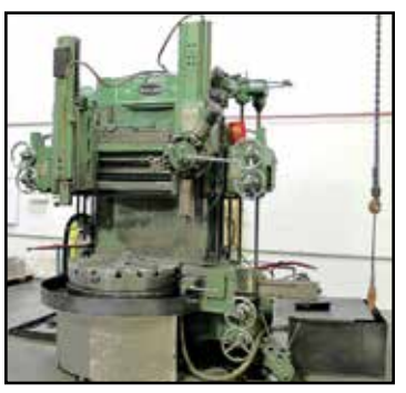
BULLARD CUT MASTER 42" VERTICAL TURRET LATHE