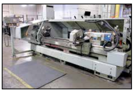
MAZAK MS-2500 CNC LATHE