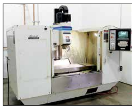
FADAL VMC4020HT CNC VERTICAL MACHINING CENTER