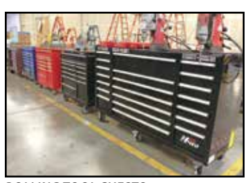
ROLLING TOOL CHESTS