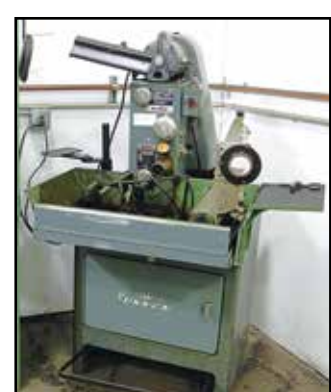
SUNNEN MBB-1660 PRECISION HONE