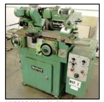
MYFORD MG-12M 5" X 12" CYLINDRICAL GRINDER