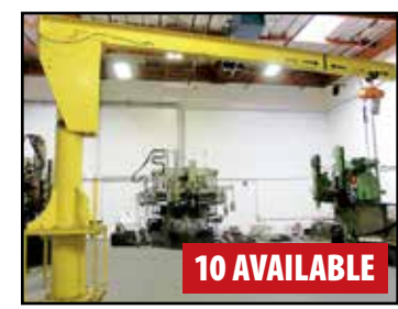
FREE STANDING JIB CRANE

SPANCO 1/2-TON FREE STANDING BRIDGE CRANE SYSTEM, 15' Span x 60' Runway x 14' Under Rail, w/Harrington 1/2-Ton Electric Hoist